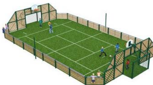
A multi sports unit for children